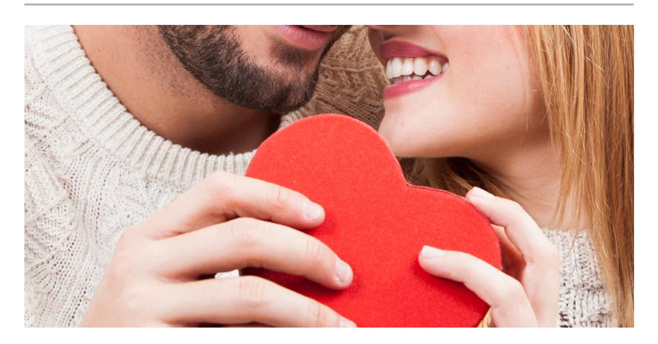
Whether a relationship lives or dies largely depends on the individuals involved.

What is seen to be an insurmountable relationship killer by one person will just be a minor challenge to another.