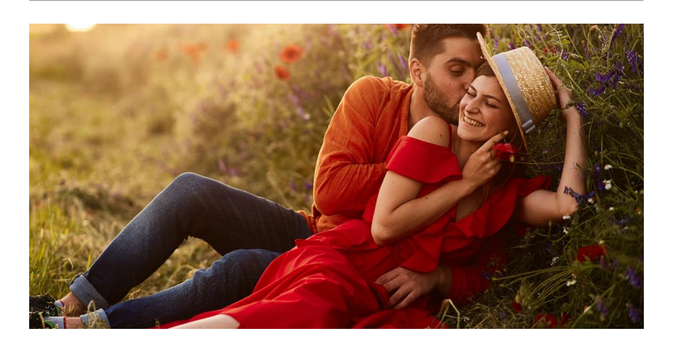
Just like regular real-world relationships, online relationships need tending, to grow over time.